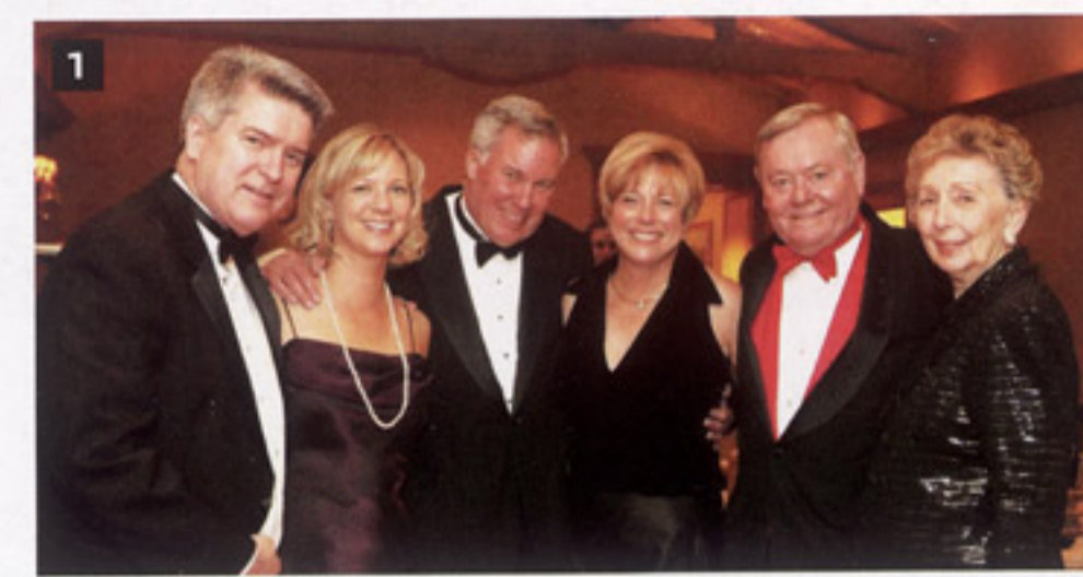
PASADENA SHOWCASE HOUSE GALA AT SAN GABRIEL COUNTRY CLUB APRIL 17TH